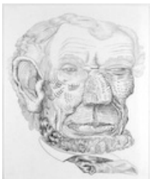
James Esber Lincoln #14, 2005 Graphite 17 x 14 inches

A Group Exhibition of Non-Traditional Portraits of United States Presidents On View at the University Art Museum